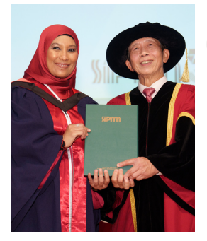
What is special about SIPMM, you don't feel left out and age doesn't matter. This is the first time that I feel age is never a barrier in learning and SIPMM made us feel accepted and validated accordingly.