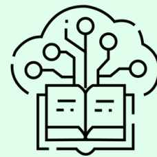
Contract Negotiation Techniques (Digital Learning)